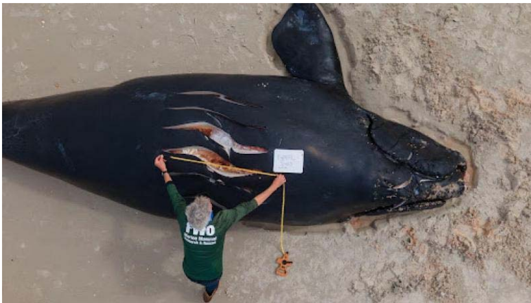
A right whale calf struck and killed by a vessel off the coast of Florida in February 2021

Gina Raimondo , Secretary, United States Department of Commerce; and Janet Coit , Assistant Administrator, NOAA Fisheries