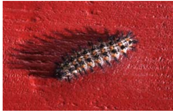
Figure 3. Cloudcroft checkerspot post-diapause larva observed late June, 1998.

The antennae are scaled and clubbed. Most species' larvae lack branching spines on the head but have many on the body, including mid-dorsal spines (Figure 3). The pupae (chrysalis) have conspicuous projections and hang from the cremaster (abdominal appendage) alone (Figure 4).