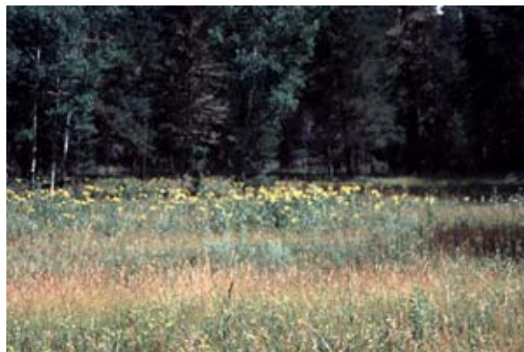
Figure 5. General view of habitat at the type locality for Cloudcroft checkerspot butterfly.

for ecosystem-based management since it is not just the mountain meadow for the butterfly and the old growth forest for the Mexican spotted owl that are important. The entire forest-meadow-riparian matrix on the landscape is what is biologically significant.