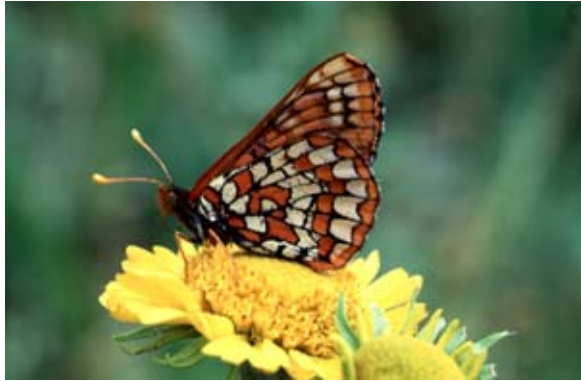
Figure 2. Underwing of Cloudcroft checkerspot butterfly.

The sexes are similar dorsally. However, the DHW pale markings are evident in the females of E. c. cloudcrofti but generally subdued in the males, which is the opposite of E. c. chuskae . Ventrally, both sexes of E. c. cloudcrofti are similar to E. c. capella . Ferris and Holland (1980) described it as boldly marked and the dorsal ground color is repeated. The principal VFW maculation consists of a repetition of the dorsal subapical white-spot rows and black outlines of the cell quadrate spots. On the VHW, the three (basal-discal, postdiscal, marginal) dark orange spot-bands are clearly defined and lack the cream-buff intrusion found in E. c. carmentis and E. c. chuskae . The veins and spot borders are strongly defined in black (Figures 1 and 2).