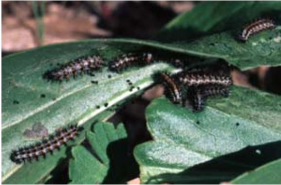
Figure 7. Aggregating larvae (pre-diapause) as seen in September 1998.

After hatching, larvae feed on host plants and undergo metamorphosis and diapause (inactive) stages prior to completing growth. Whether full development is reached in one year or requires more than one year in the subspecies cloudcrofti is not certain at this time. Butterflies associated with alpine habitats often undergo multiple year diapause prior to completion of growth due to the short growing season there. Although E. c. cloudcrofti is found in a subalpine environment rather than a true alpine zone, it may have multiple year diapause. Pratt (pers.comm.) observed larvae in multiple stages of development on his 1998 field visit to the type locality. He also reported observing large and very small larvae entering diapause, suggesting they require 2 years to complete their development.