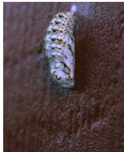
Figure 4. Cloudcroft checkerspot pupa attached to the wood siding of a building in late June, 1998.

The E. chalcedona-anicia checkerspot is extremely variable. Adult butterflies are small