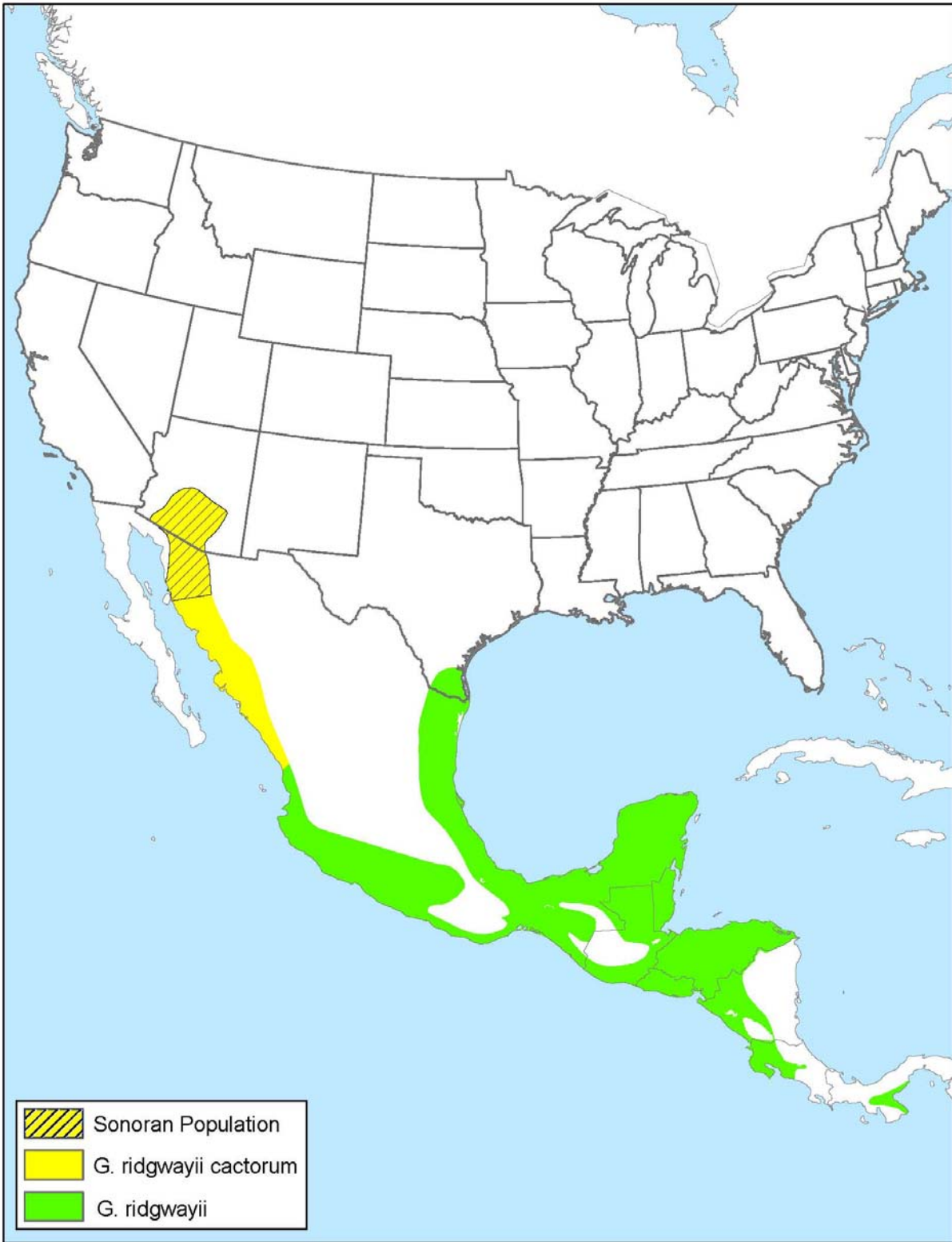
Figure 1. The range of Glaucidium ridgwayi with the western subspecies cactorum depicted in yellow and the Sonoran Desert population depicted with diagonal lines.