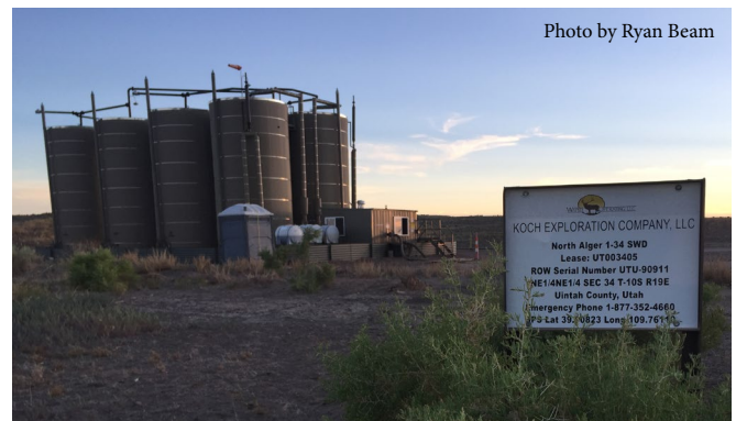
Koch Exploration Company facilities on public lands, Uintah County, Utah.

According to the Climate Investigations Center, between 2009 and June 2018 Koch Exploration Company purchased oil and gas leases on more than 28,000 acres of federal public lands in Montana, Colorado, Wyoming, New Mexico and North Dakota. 9 In Montana, Koch Industries' Matador Cattle Company is listed as the permit holder for more than 128,000 acres of public land managed by the Bureau of Land Management for cattle grazing. 10 The Koch Industries-owned Georgia Pacific, one of the largest forest products companies in the United States, has federal contracts to log trees from national forests. 11