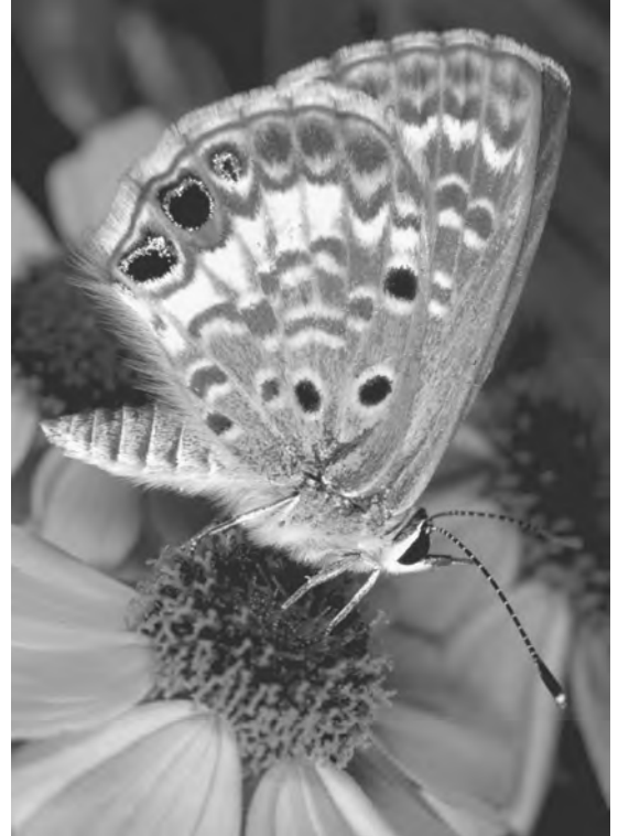
Miami blue butterfly

Under the settlement agreement, the U.S. Fish and Wildlife Service has issued positive findings determining that Endangered Species Act protection of hundreds of freshwater species may be warranted, including 374 species dependent on the beleaguered rivers and streams of the southeastern United States. Those species — found in 12 states — include 43 fish; 89 crayfish and other crustaceans; 81 plants; 78 mollusks; and 51