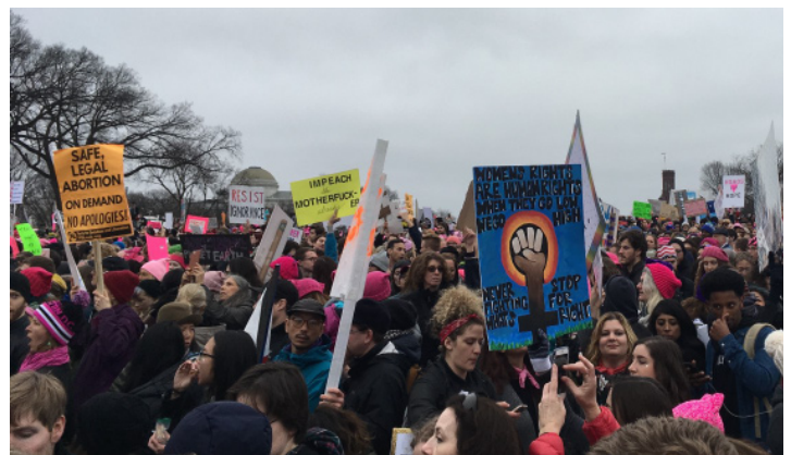
Women's March DC, January 21, 2017.

However the Trump administration is doing everything it can to prevent that equitable, sustainable future. Recently the United States rejected a UN resolution to protect women and girls from violence because it included a provision to protect women getting legal abortions. More directly, the Trump Administration has been pushing policies since its first week in office to curtail aid and funding to international reproductive healthcare programs that help provide voluntary contraception to developing nations with high fertility rates.