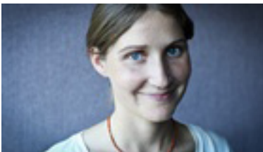
Contributed By Amelia Templeton

The Center For Biological Diversity is handing out free condoms with a conservation message.