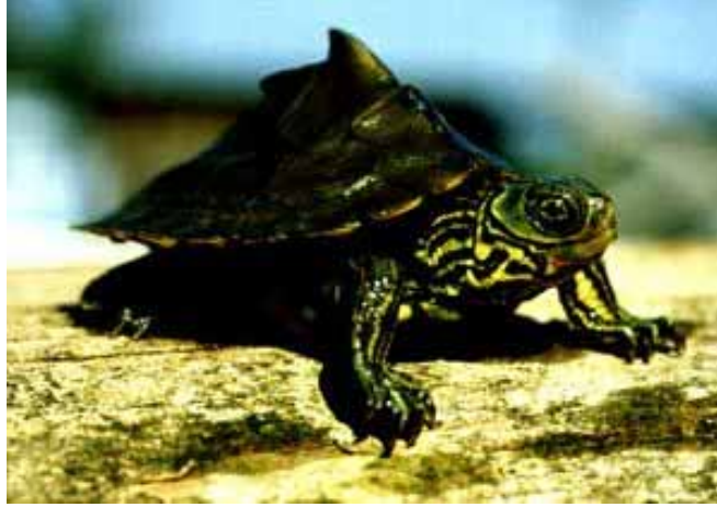
Barbour's map turtle ( Graptemys barbouri )

BEFORE THE COMMISSION OF THE GEORGIA DEPARTMENT OF NATURAL RESOURCES AND THE GOVERNOR OF GEORGIA