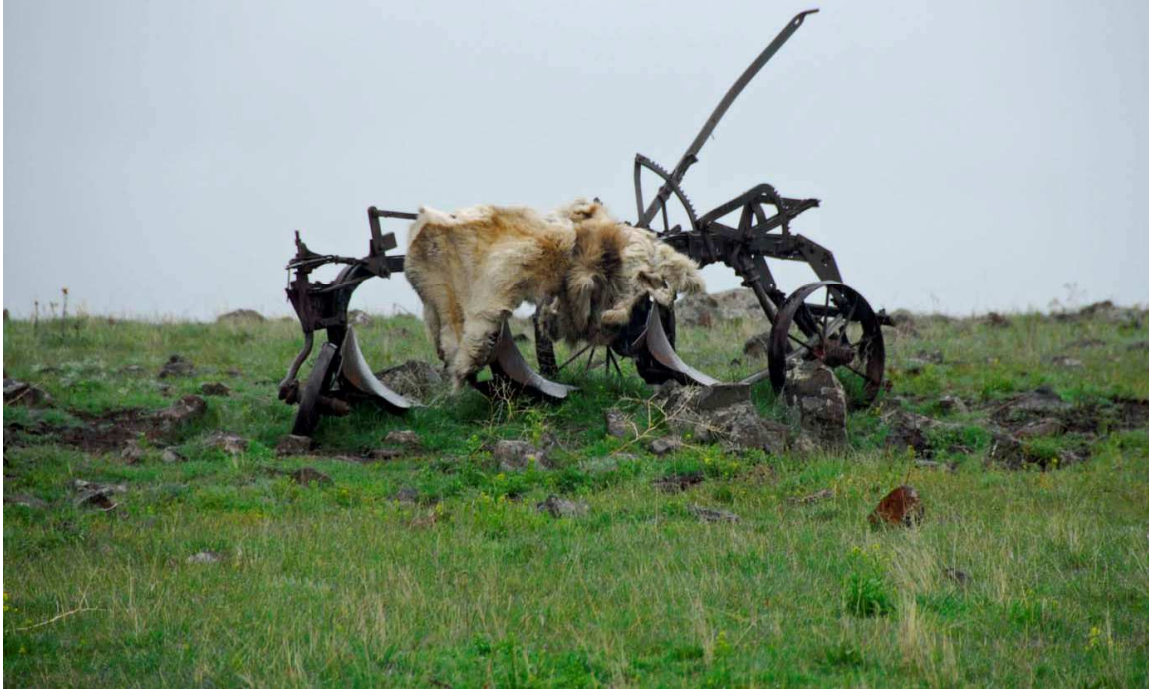
2nd Carcass photographed from Daggett Road, Joseph, Oregon May 22 2010