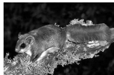
Northern flying squirrel

After we submitted comments last November opposing the mouse's proposed Wyoming delisting, the Fish and Wildlife Service pledged to reconsider that proposal and the inadequate habitat designation.