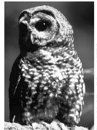
Northern spotted owl

This August, the Center hauled the U.S. Fish and Wildlife Service to court for failing to reconsider how logging mature and old-growth trees in Oregon's Elliott State Forest harms the northern spotted owl.