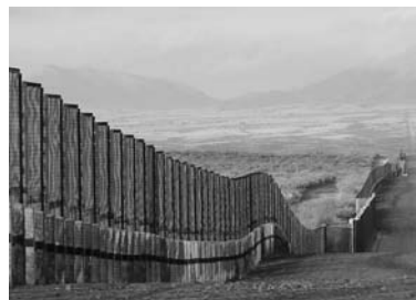
Border fence near the San Pedro

been significantly blocking the natural flow of water in Organ Pipe Cactus National Monument. As we predicted would happen where it crosses the San Pedro River watershed, the wall has become a dam, trapping floodwater and debris and causing grave ecological effects.