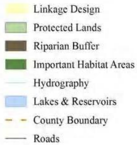
Figure 46. Linkage Design